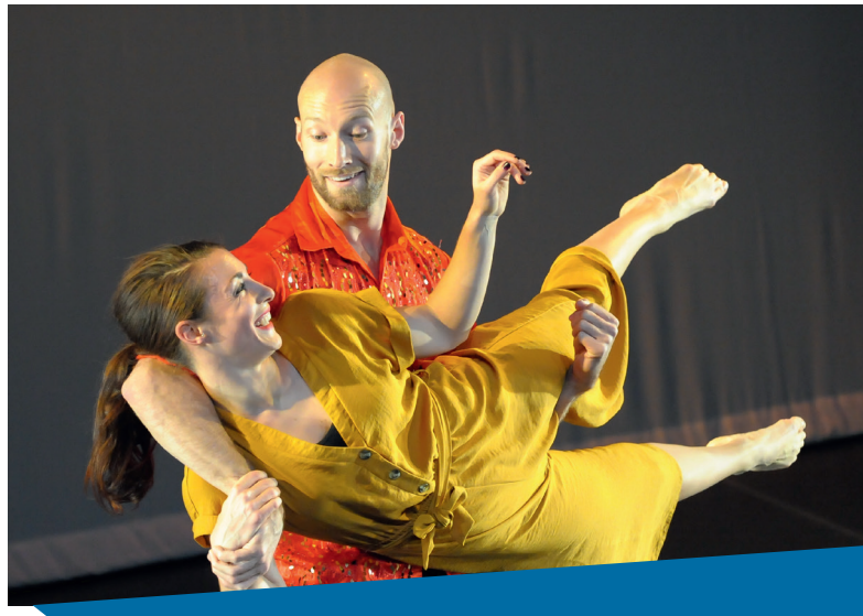
Motionhouse performing at the Macready Theatre launch

Renowned poet John Agard who performed in The Festival on The Close 2017